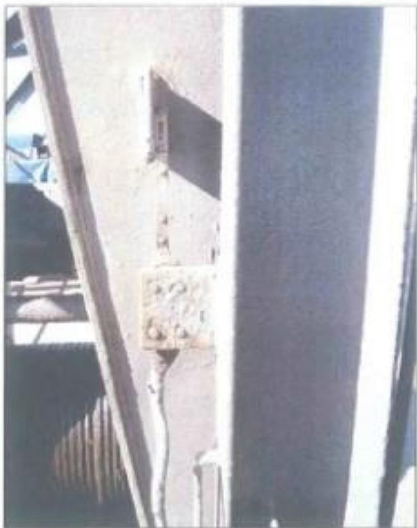
Fig. 4 Limit switch for winch motor