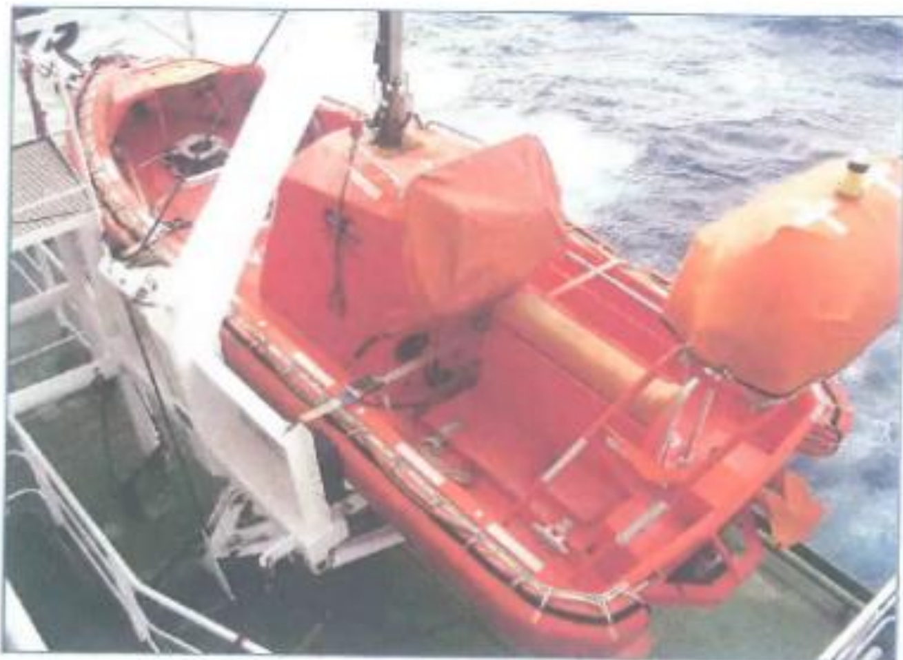
Fig. 10 Rescue boat in stowed position