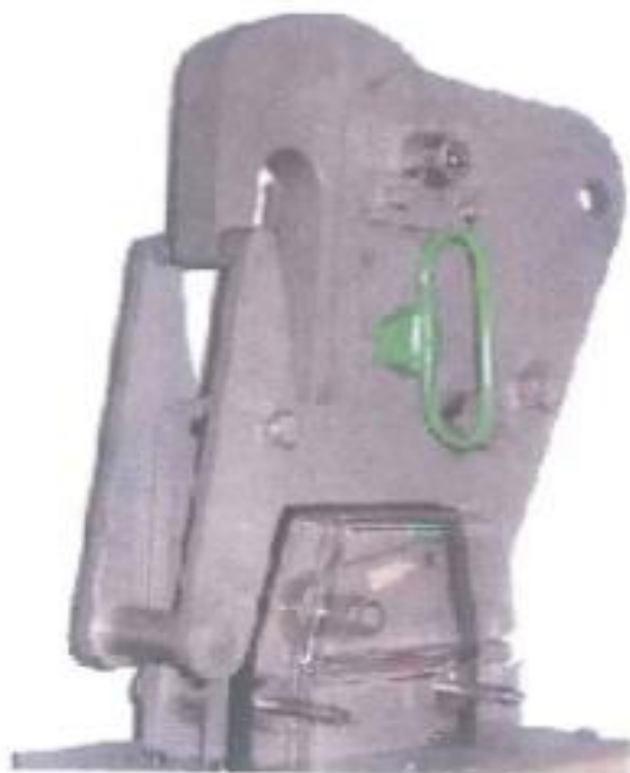
Fig. 6 A safety pin used as a fall preventer device