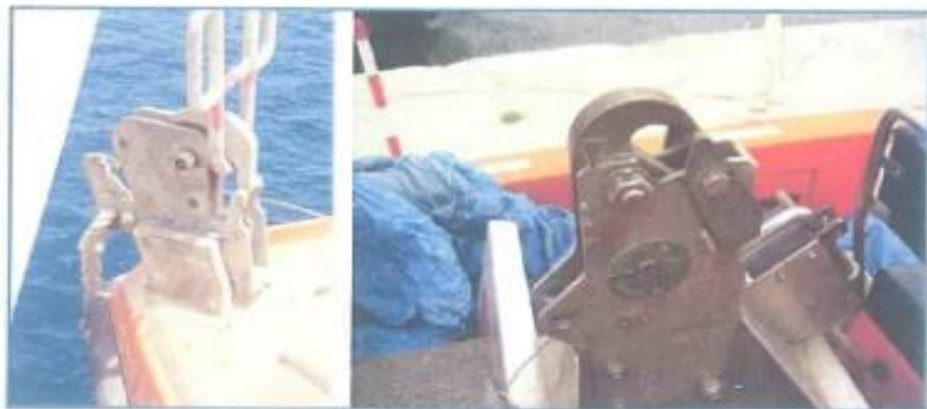
Fig. 7 Examples of different hook arrangements