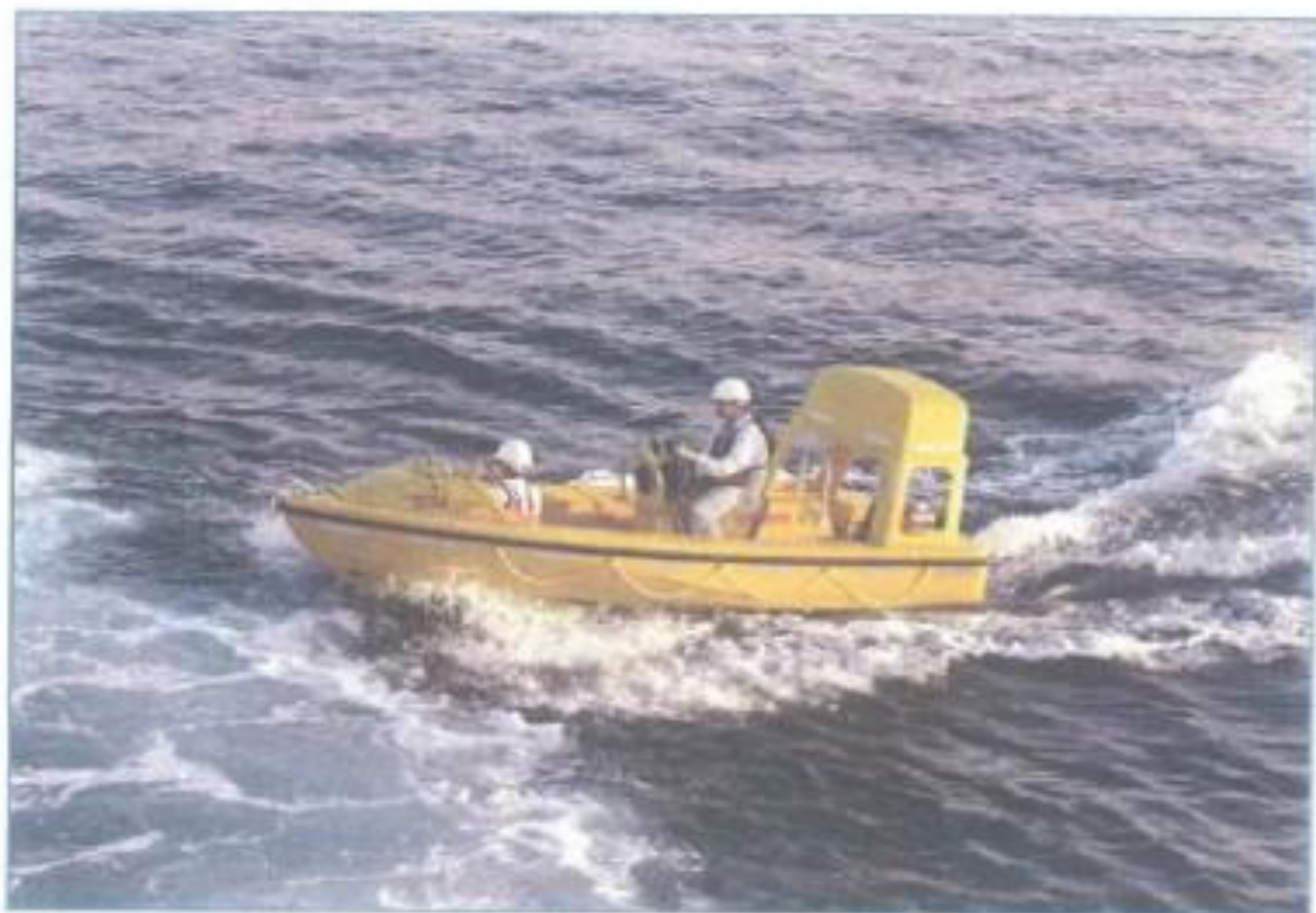
Fig. 11 Rescue boat