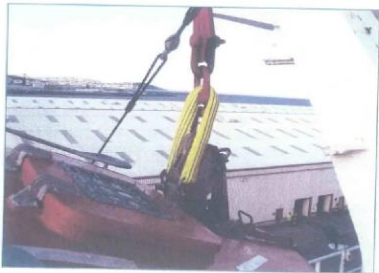
Fig. 5 A synthetic stop as a fall preventer device